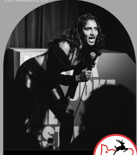
Rip City Comedy Fest '23