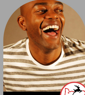
Rip City Comedy Fest '23