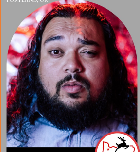
Rip City Comedy Fest '23